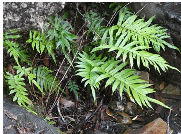
Blechnum wattsii , hard water fern