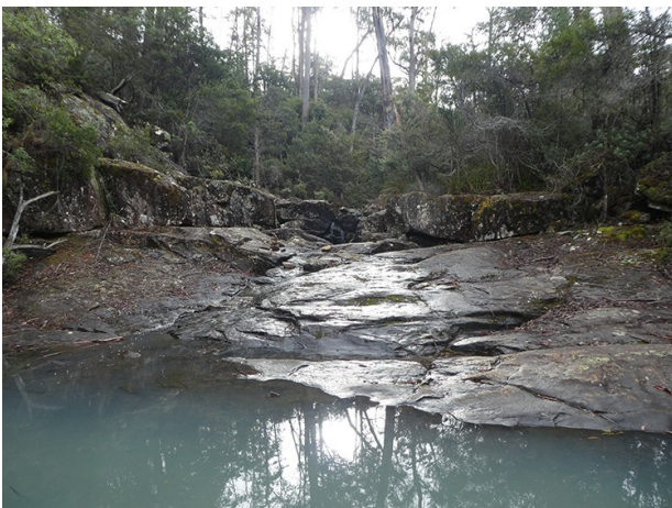
Lost Falls near Lake Leake

Birds – Corvus tasmanicus , forest raven ; Fulica atra , eurasian coot ; Lichenostomus flavicollis , yellow-throated honeyeater ; Phalacrocorax sp., cormorant ; Phylidonyris pyrrhoptera , crescent honeyeater ; Platycercus caledonicus , green rosella ; Strepera fuliginosa , black currawong