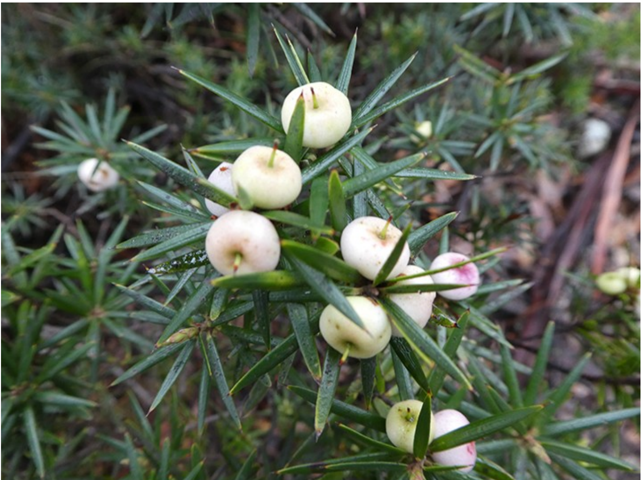
Cyathodes glauca Lake Leake Highway - Lost Falls trip